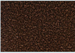
COPPER VEIN • PLRS 90242