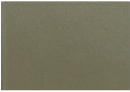
CHAMPAGNE • 349/68780