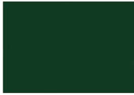
HUNTER GREEN • RAL 6009