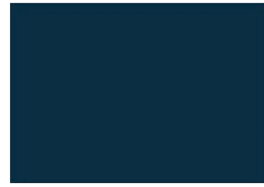
SAPPHIRE • RAL 5003