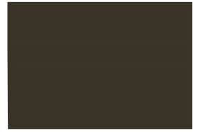
BRONZE • 39/60020