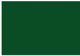
EVERGREEN • 39/50060