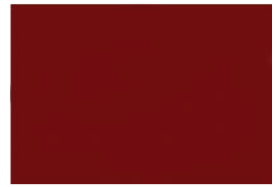
BURGUNDY • RAL 3005

Colors may vary slightly due to printing processes. SAFETY YELLOW is available upon request for no added charge. An additional 160 custom colors and color matching are available for a surcharge. Colors and metal samples available upon request.