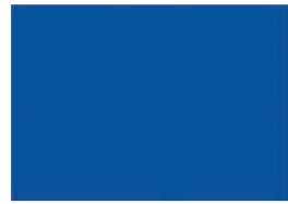
NANTUCKET BLUE • RAL 5005