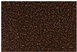
COPPER VEIN • PLRS 90242 *