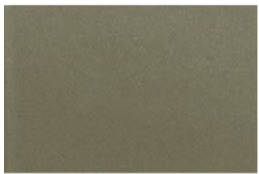
CHAMPAGNE • 349/68780