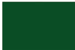
EVERGREEN • 39/50060