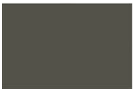
CHARCOAL • RAL 7022