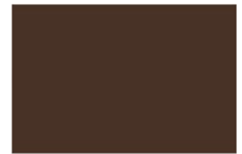
CHOCOLATE • RAL 8028