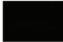
GLOSS BLACK • 38/80010