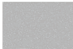
SPARKLE SILVER • 49/90450