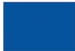
NANTUCKET BLUE • RAL 5005