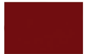
BURGUNDY • RAL 3005

Colors may vary slightly due to printing processes. SAFETY YELLOW is available upon request for no added charge. An additional 160 custom colors and color matching are available for a surcharge. Colors and metal samples available upon request.