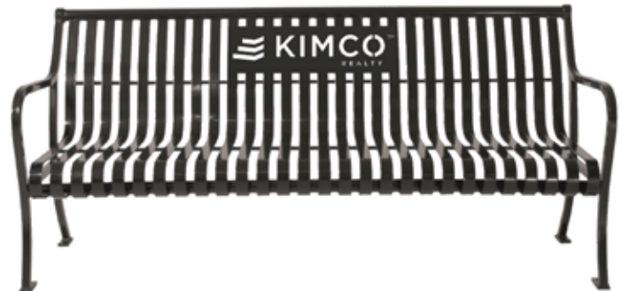
P26 Pullman Bench with Back 6' with Laser Cut